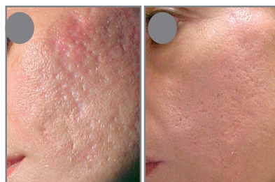
Fig. 2: Acne scar reduction with Fotona laser: Before and After (Courtesy of Dr. Luppino)

2. Acne scars: The Er:YAG laser is used to remove micron-thin layers of skin so that new skin can form in its place. Unlike chemical peels and dermabrasion, laser resurfacing allows to be easily controlled. The laser gently vaporizes the acne-scarred surface of the skin so that undamaged skin below is revealed.