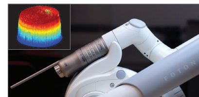
Fig. 2: OPTOflex® projected beam profile

Laser removal of pigmented lesions can be performed with Fotona's QX MAX laser system. Fotona additionally offers a Pigmented Lesions Removal Upgrade Kit, giving practitioners the necessary knowledge, accessories and tools to confidently and skillfully remove pigmented lesions. Training in Laser Removal of Pigmented Lesions is provided through Fotona's partnership with the Laser and Health Academy, where participants cover basic laser physics and gain an in-depth understanding of laser-tissue interaction. Live demonstrations give participants an insight in Laser Removal of Pigmented Lesions and other aesthetic procedures that can be performed with the QX MAX laser.