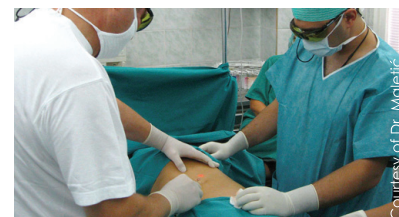
Fig. 3: Fotona's Laser Lipolysis treatments produce great results with faster healing.

Laser lipolysis is less invasive than classical liposuction because only a 1-2 mm incision is required to insert the cannula with a laser fiber and there is usually no need for general anesthesia. The fatty tissue removal process requires less external force and exertion compared to the standard liposuction. Thermally induced coagulation minimizes bleeding and trauma, as well as post-treatment bruising and swelling. Patients can thus expect shorter recovery times and a reduced need for compressive garments, while they can get back to their daily activities virtually immediately after the procedure. Complementary optimal skin tightening effects add to high patient acceptance and shortened recovery times.