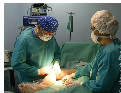
Fig. 3: Fotona's EVLA Tx have exceptional success rates and shorter recovery times

all treatment parameters on one screen. At the touch of a button, the laser system accommodates laser parameters to the application, providing unrivalled convenience.